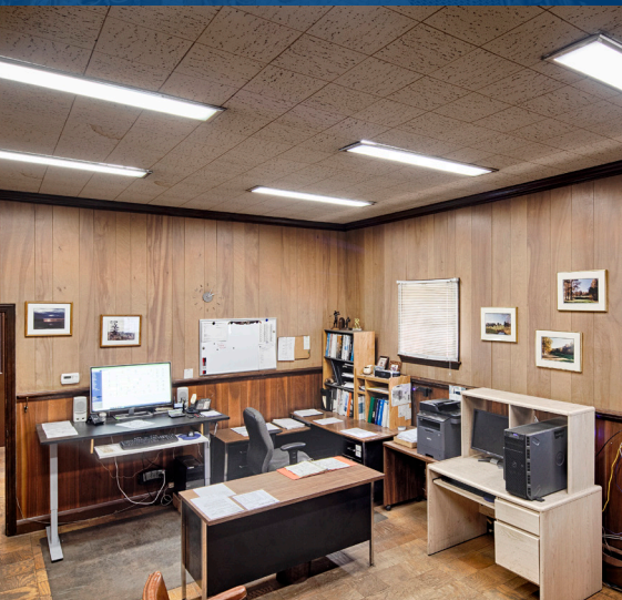
New lighting improves the office atmosphere and provides long-lasting value.