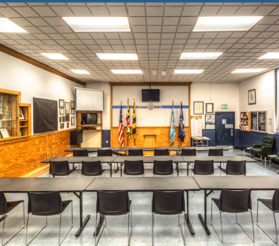
Overhauling the lighting in this briefing room at the police station resulted in more consistent illumination throughout the space.