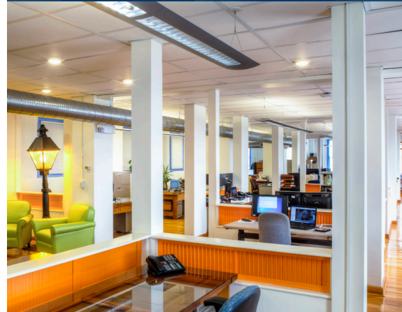
Energy efficiency upgrades in the Abel Wolman Municipal Building helped make it a model for green offices in the city.