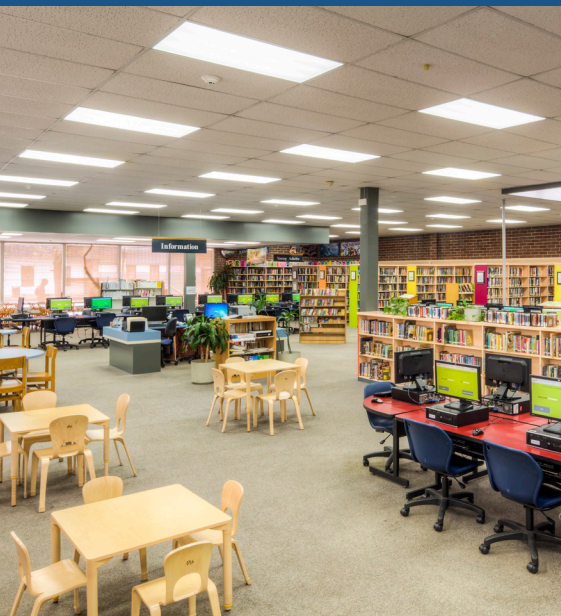
In addition to saving energy, the new overhead lighting in this library creates an inviting environment to inspire young readers to crack open a book.