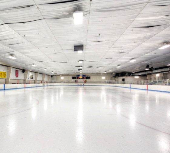
Skaters and spectators alike will find it easier to keep an eye on the puck thanks to lighting upgrades at this city-run ice rink.