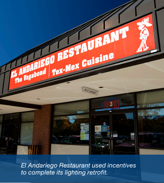
El Andariego Restaurant used incentives to complete its lighting retrofit.