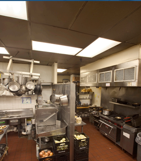
New lighting in the kitchen provides a brighter and, therefore, safer working environment for restaurant staff.