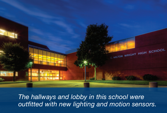
The hallways and lobby in this school were outfitted with new lighting and motion sensors.