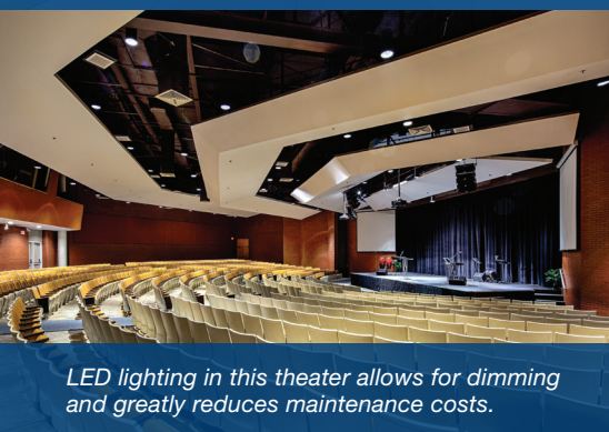
LED lighting in this theater allows for dimming and greatly reduces maintenance costs.