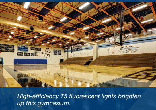
High-efficiency T5 fluorescent lights brighten up this gymnasium.

The installation of new LED exterior wall pack lighting and motion sensors not only helps reduce energy use but also minimizes light pollution, a boon to neighbors and student stargazers at HCPS's environmental education center. Plus, says Christine Langrehr, principal at Forest Lakes Elementary School, "Parents [have] remarked on the additional lighting outside the school with regard to improved safety and security."