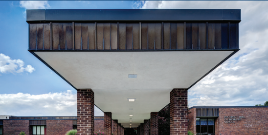
The new LEDs above this walkway are so bright that HCPS reduced the number of fixtures needed.